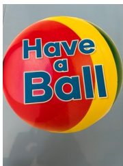
Have a Ball Teaching Strategies